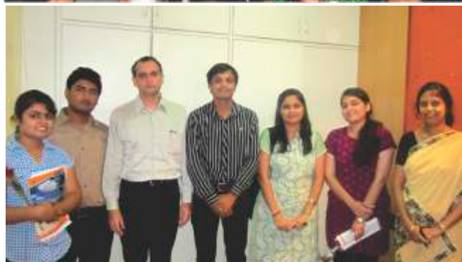
Students Organizing Team of HR Forum & Finance Forum