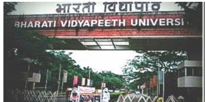
(Volunteers of IMED with Zoo – Zoo character at Bharati Vidyapeeth University, Katraj.)