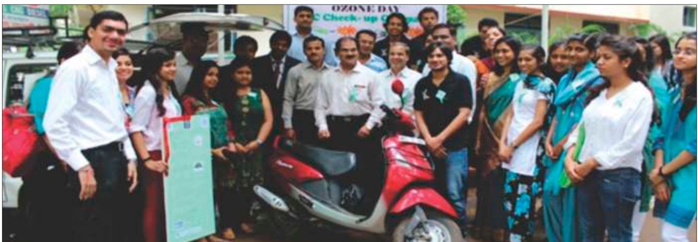
(Inauguration of PUC Check up Camp)